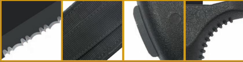
1/2 serrated edge